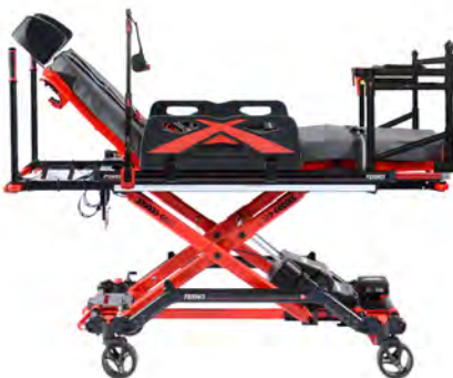
* Photo showing POWERX with various configurable options