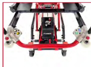
Simple to operate controls