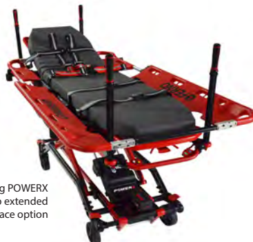
* Photo showing POWERX with Split Scoop extended patient surface option