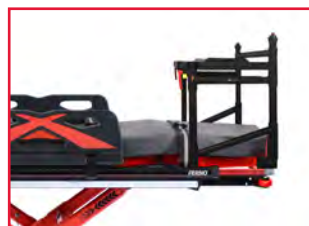
Optional PacRac+ equipment table