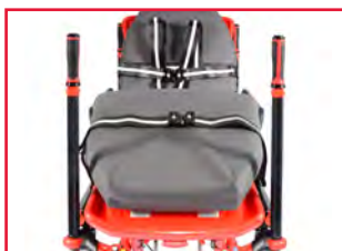
Push-Poles with grip handles for improved manoeuvrability

Minimised in form, but not in function – lighter by design, easier to clean with improved IPC, easier to maintain, with an impressive overall visual aspect